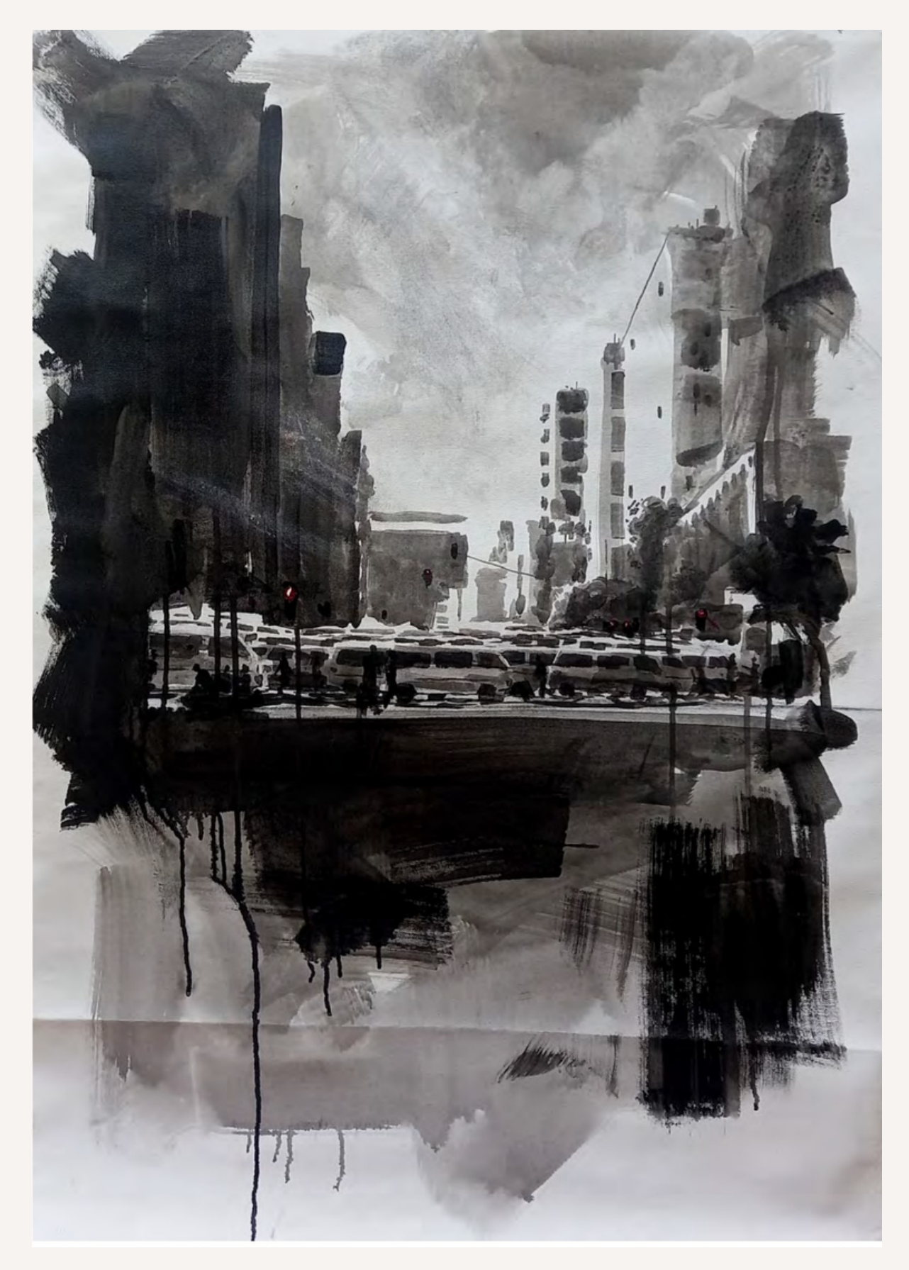
Thabang Lehobye Rush Hour 86 x 59 cm Mixed media on Canvas 2023